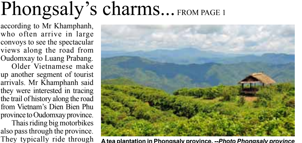
A tea plantation in Phongsaly province.

More than 778,000 hectares of wet season rice and over 126,600 hectares of dry season rice are grown annually in Laos. However, about 226,000 hectares of rice fields in flatland areas are totally dependent on rainfall because irrigation channels have not yet been built in those areas.