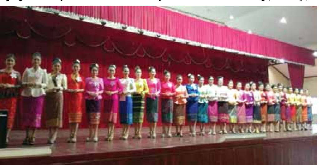
Twenty-eight young women take part in the first round of the 2017 Miss Champassak contest before 20 contestants are chosen for the final round which will take place on March 31. The contest is organised by the Champassak provincial Department of Information, Culture and Tourism.